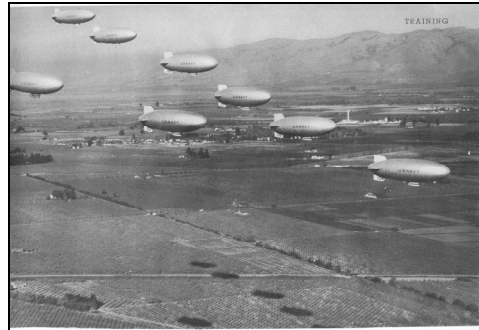
Training exercise over Tustin

Second Blimp Hangar Tour Scheduled for Saturday, March 26 th Sign up now!