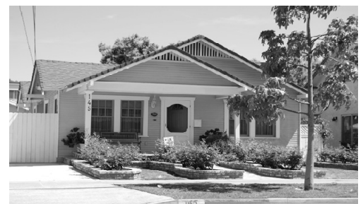
Outstanding Restoration/Preservation The Howes House at 145 Pacific

Enclosed in this newsletter is the form you can use to nominate your choice to receive one of the awards. Outstanding Preservation/Restoration, Neighborhood Beautification, Historically Accurate Addition, and Outstanding Adaptive Reuse are the categories. Look over the form today and send it in by March 31 st to help honor your favorite Old Town home or business.