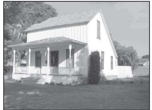
The Lindsay House

Conservancy Board Members and volunteers pitched in with funds, equipment and “elbow grease” to revamp the front lawns of two very historic homes in Old Town. The Lindsay House and Patton House in the 300 block of C Street were in need of new lawns, shrubs and sprinkler systems, so at the request of the owners the Conservancy took on the job as a neighborhood project.